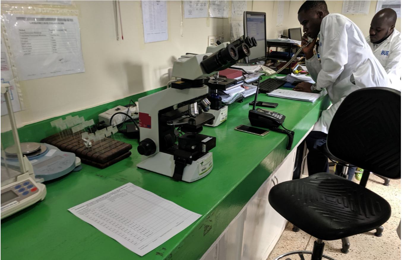
Image 2: Microscopy retains a central role in NTD diagnosis.