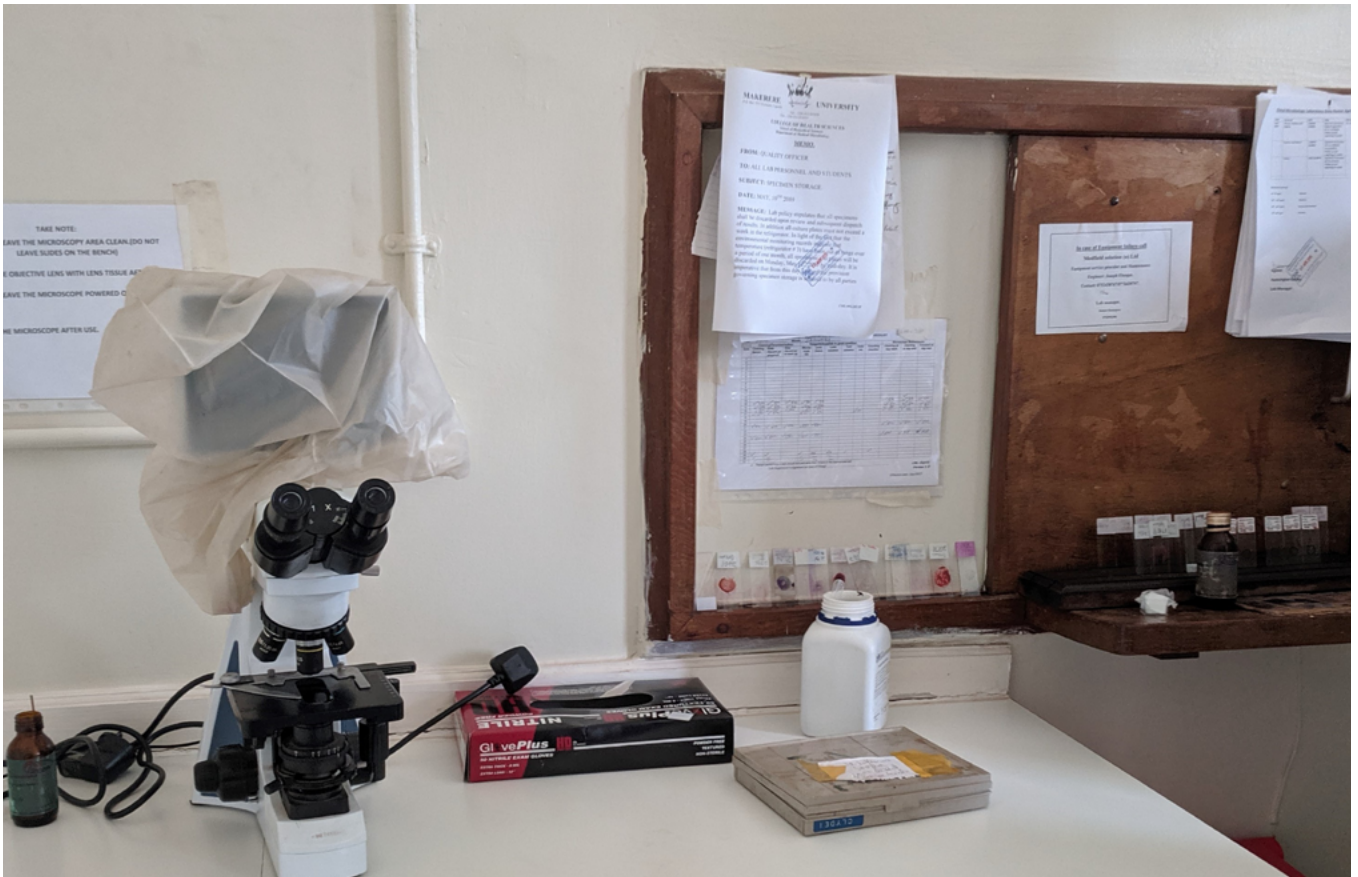
Image 4: Microscope station at the microbiology and molecular laboratory, Makerere University, Uganda (photo credit: DiaDev project, Edinburgh University).

It is pertinent therefore that much of New Zealand's success to date has been credited to its localised Find, Test, Trace, Isolate, Support (FTTIS) approach, which is managed through the country's 12 national health services (in addition to tight border control). New Zealand's elimination strategy has never hinged on major technological advancement, but rather on its fidelity to a number of proven public health measures delivered with local oversight. In this manner, one of the country's most important steps toward securing COVID-19 elimination was to urgently increase its workforce for contact tracing (Baker 2020b). In contrast, the poor performance of England's test and trace system has been blamed on a centralised approach that favoured private contractors over local public health teams (Mueller 2020).