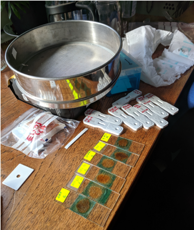
Image 3: Materials for schistosomiasis field testing

A feature of most elimination (and eradication) programmes is that great progress can be wrought in the early stages of a given campaign by transplanting a similar set of interventions anywhere . A number of NTD programmes—like onchocerciasis and lymphatic filariasis—have made notable progress toward elimination targets through the delivery of mass drug administration (the distribution of treatment to large numbers of people without need for diagnosis) (WHO 2020). The essential difficulty with elimination (and eradication) comes as you approach the endgame: when case numbers are down, community compliance begins to falter, and the costs attached to finding/preventing residual cases begins to escalate. Indeed, this is a key argument frequently used to discourage the setting of elimination and eradication targets in